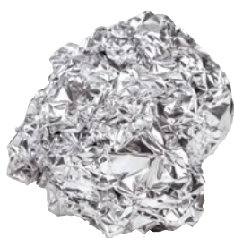
Clean Aluminum Foil