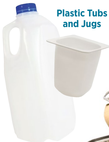
Plastic Tubs and Jugs