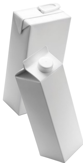
Milk and Juice Cartons