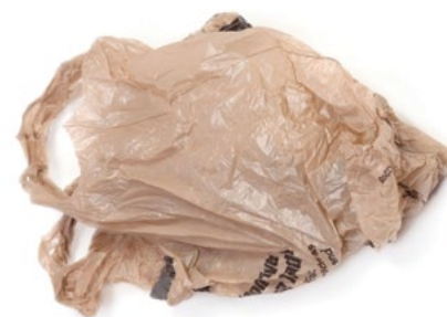
Plastic Bags & Flexible Plastics