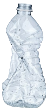
Plastic Drinking Bottles